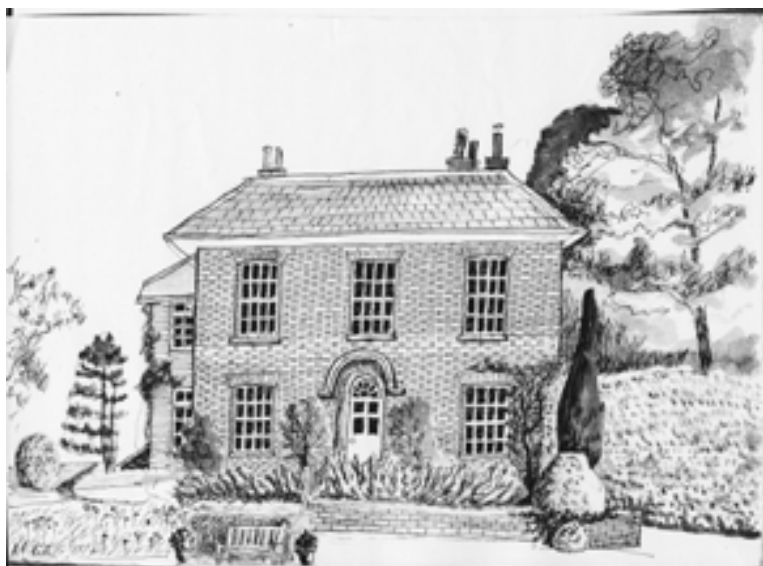
The Deane House, Sparsholt, Hampshire